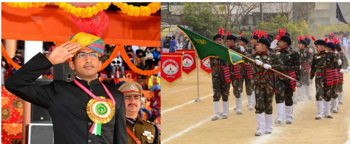
CEO, SMVDSB taking salute at Republic Day function.

CEO added that emphasis has been laid on yatra management, with projects like Skywalk at Bhawan and the remodeled Parvati Bhavan which have proven to be