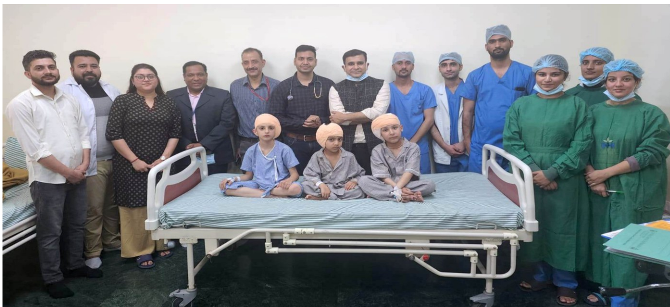
SMVDNSH team after performing Cochlear Implant Surgeries

It was also informed in the meeting that the Board has sponsored as many as 23 Cochlear Implant Surgeries as part of its local outreach initiative.