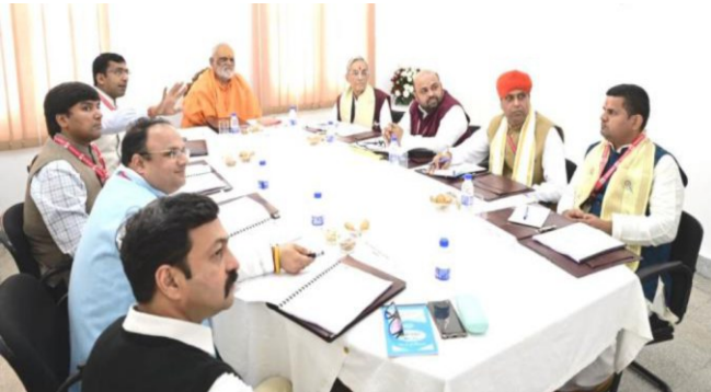
SMVD Gurukul holds 32 nd Governing Council Meeting