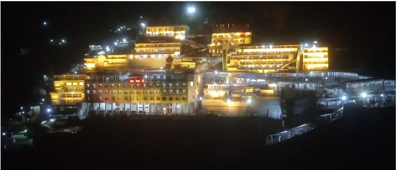
Shri Mata Vaishno Devi Ji Bhawan lit up ahead of Ram Mandir consecration.

In a beautiful display of spiritual unity, Mata's Bhawan had been decked in vibrant lights, adding to the already palpable excitement surrounding the Pran Pratishtha ceremony. In this luminous spectacle, devotees found not just aesthetic beauty, but a sense of peace and joy as they prepared to celebrate a historic moment for their nation. The Shrine Board viewed it as a tribute to Lord