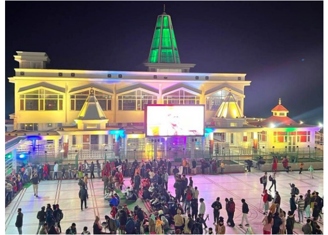
Adhkuwari Complex lit up ahead of Ram Mandir consecration.

As the nation geared up for the Ram Mandir consecration, the establishments of Shri Mata Vaishno Devi Shrine Board were lit up on 20 January 2024, symbolizing a poignant reminder of the unifying power of faith. The spiritual fervor transcended geographical boundaries and religious denominations, weaving a tapestry of shared devotion that resonated across India.