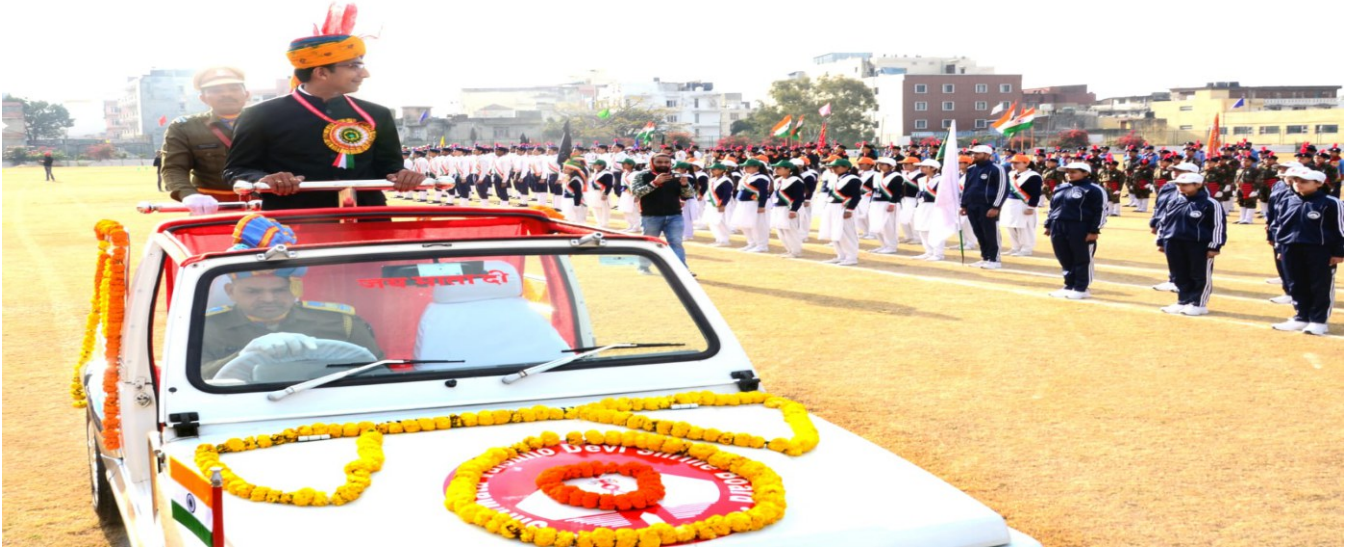
75 th Republic Day celebrations at Katra

the illumination of façade by digitally-controlled, multi-coloured LED lights will be a permanent feature from the coming Chaitra navratra at Darshni Deodi,