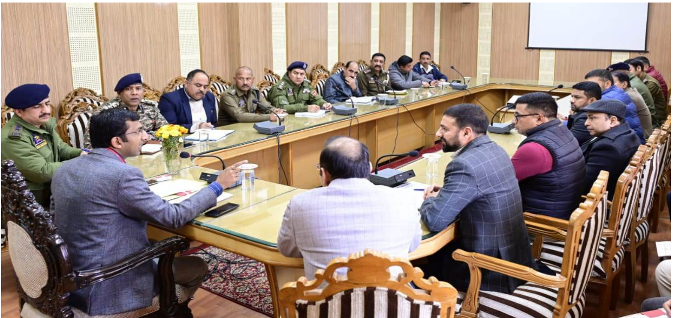
CEO Shrine Board holds security review meeting

Chief Executive Officer stressed for action on diverse fronts for hassle free pilgrimage which included issuance and verification of Radio Frequency Identification (RFID) cards, effective crowd management, augmentation of holding areas on the track and in Katra town, working out plans for decongestion of the entire track, particularly the Bhawan area and all time surveillance through dedicated CCTV network of over 700 cameras. He further exhorted all security agencies to remain more vigilant so that no pilgrim without frisking and valid registration enters the track for their pilgrimage.