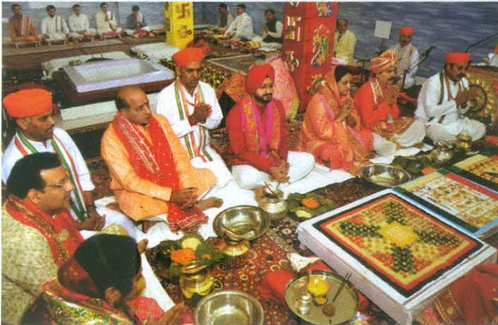
Commencement of Shat Chandi Maha Yagya at Shri Mata Vaishno Devi Ji Shrine on 1 st Navratra.

Shat Chandi Maha Yagya organised by Shri Mata Vaishno Devi Shrine Board at the Holy Cave Shrine of Shri Mata Vaishno Devi Ji commenced on 29 September on the auspicious occasion of commencement of Navratras. The Maha Yagya, which is performed at the Holy Cave Shrine during Navratras for peace and prosperity, will conclude with Purna Ahuti on Mahanavami.