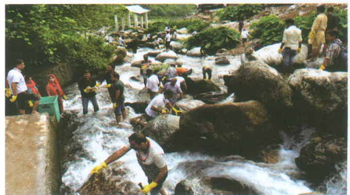
Cleaning of Banganga.

As part of the cleanliness campaign 'Swachhata Hi Seva', Shri Mata Vaishno Devi Shrine Board organised several activities in collaboration with the Indian Oil Corporation. These included a special sanitation drive covering the Bhawan area, Sanjichhat, Bhairon Complex, Adhkuwari, Tarakote Marg, Banganga and Shri Mata Vaishno Devi College of Nursing, Kakryal. The objective of this Shramdaan Divas activity was limiting the use of single use plastic and to collect all types of plastic waste, increasing awareness among the pilgrims, local population and all other towards environment.