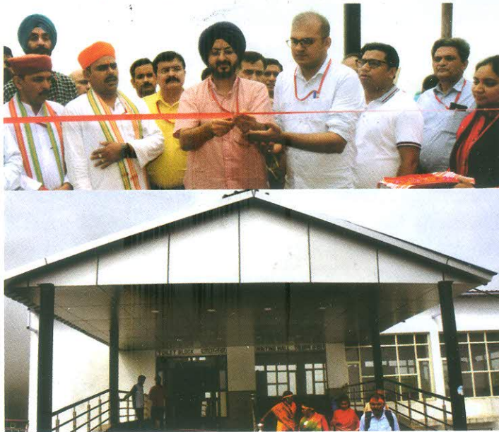
CEO inaugurating biggest Toilet Complex at Adhkuwari.

by way of replacement of the earlier stone with carved marble stone involving a cost of Rs. 25 lakh. At Adhkuwari, the CEO inaugurated a 4-storey earthquake resistant Toilet Block having modern facilities. With built up area of 8760 sft, this Rs. 2.70 crore Toilet Block, is the biggest Toilet Complex in the Shrine area. The Toilet meets the requirements of the senior citizens and specially-abled persons. It also has an elevator, lockers, 4-room accommodation for sanitation staff and store, etc. The rooftop of the Toilet Block which is at the track level provides resting place for the pilgrims, particularly during rains.