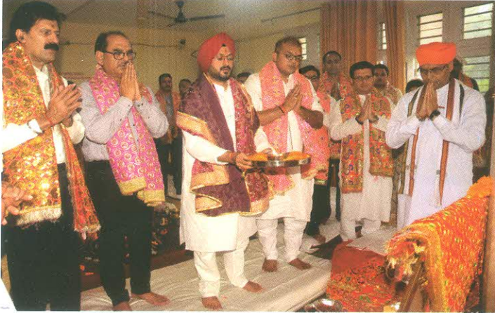
Pooja and Havan being performed to mark celebration of 34 th Foundation Day of Board at Katra.

At the culmination of these functions, Prasad was distributed to the pilgrims and employees of Shrine Board took pledge to perform their duties with sincerity and devotion.