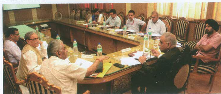
27 th GC meeting of SMVD Gurukul.

training and required skills to the students in Vedic Mantras, Karam Kand, Jyotish, Vastu Shastra and other religious ceremonies and rituals, so that they find adequate job opportunities after passing out from the institution.