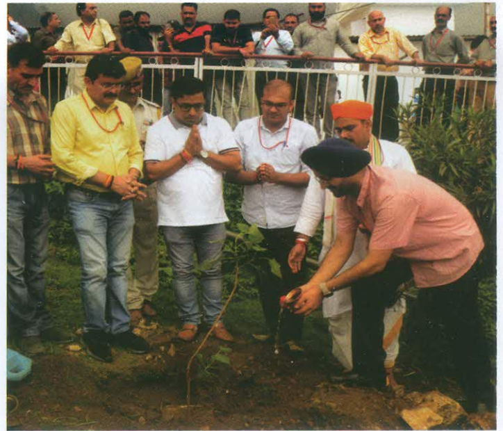
CEO watering a newly planted sapling of Peepal at Adhkuwari.

horticulture, floriculture, medicinal and ornamental species.