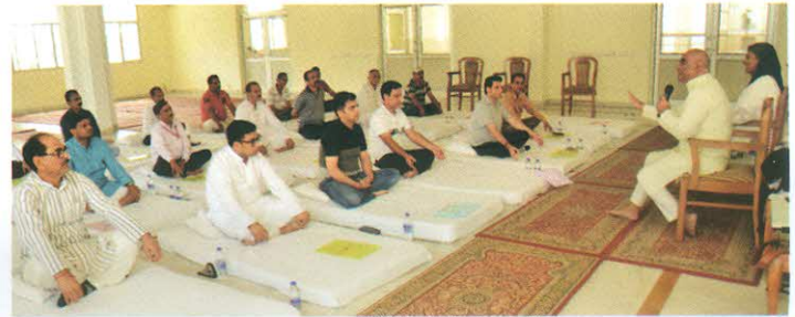
Training programme conducted by Art of Living at SGC, Katra.

A 'Happiness Programme' through the Art of Living organisation was also arranged for senior management of the Board.