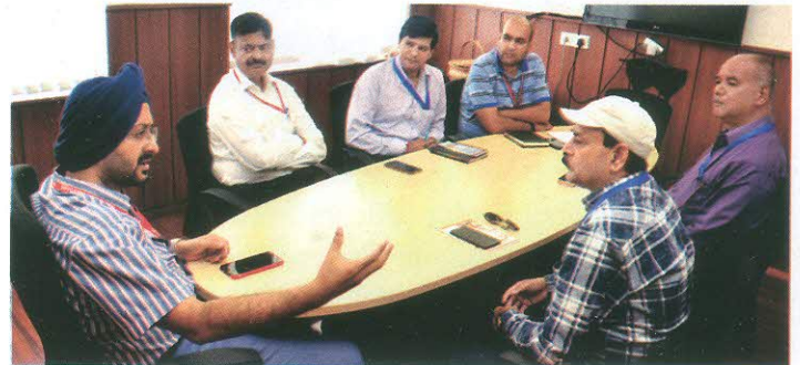
Rudraprayag officers team interacting with CEO Shrine Board.