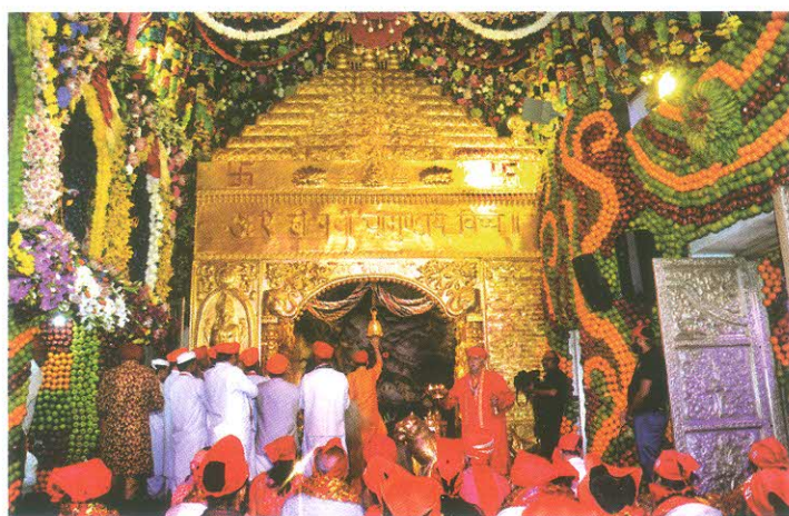
A magnificent view of gold plated Dwar at traditional Cave of Shri Mata Vaishno Devi Ji during Navratras.

The magnificent gold plated entrance of the traditional Holy Cave of Shri Mata Vaishno Devi Ji, nestled in the Trikuta Hills was dedicated during ongoing Navratras for darshan of devotees amidst chanting of Vedic Mantras and performing of Pooja and other religious ceremonies.