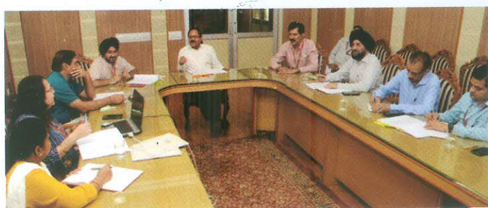
35 th GB meeting of SMVDCoN.

It was informed that the first batch of students of the college will pursue their internship training at the Narayana Health Group of Hospitals at Bangalore, Delhi and Jaipur and other places in the country. The internship of the first batch of the SMVDCoN, which is passing out next year, will commence from January 2020.