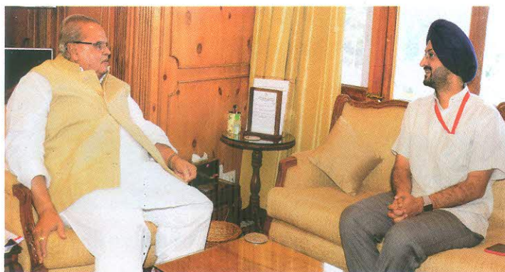
CEO Shrine Board meets Governor Satya Pal Malik.

The Chairman of the Shrine Board complimented the CEO and all employees of the Board, particularly the sanitation staff, who by dint of their hardwork won the best Swachh Iconic place in the country award for the Shrine and brought laurels at the national level. As an encouragement to the dedicated team of sanitation staff, the Governor announced one week's additional salary for the sanitation staff as a special one-time incentive.