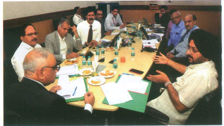
58th GB meeting of SMVD Narayana Superspeciality Hospital.

patient care at the 230-bedded tertiary care hospital in tune with the emerging requirements.