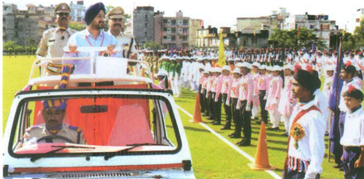
CEO Shrine Board inspecting I-Day parade at Katra.

occasion for his outstanding work in Mule Dung Composting Project of the Board.