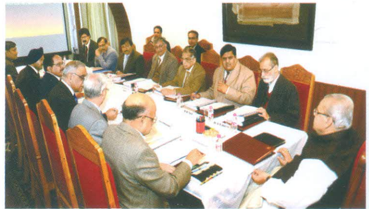
Governor, Sh. Satya Pal Malik chairing 63 rd meeting of SMVDSB at Raj Bhavan, Srinagar on 13-10-2018

The meeting reviewed the functioning of the Shri Mata Vaishno Devi Narayana Superspeciality Hospital, Kakryal and approved a Medical Support Policy for the treatment of victims of public trauma under its social support initiative at the Superspeciality Hospital. The beneficiaries in this policy will include public trauma victims of road accidents, landslides or shooting stone incidents and such calamities from the surrounding areas of the Shrine referred to the hospital by the concerned Deputy Commissioners to provide emergency medical aid. Medical assistance shall be provided in all such cases by the Shrine Board till the stabilisation of the patient upto a ceiling of Rs. 2 lakh as a goodwill gesture for such critical cases.