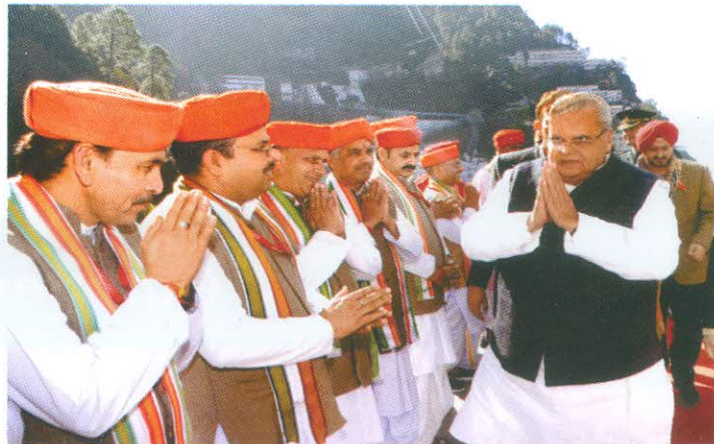
Governor, Sh. Satya Pal Malik at Holy Shrine on 30-11-2018

The Governor complimented the entire team of