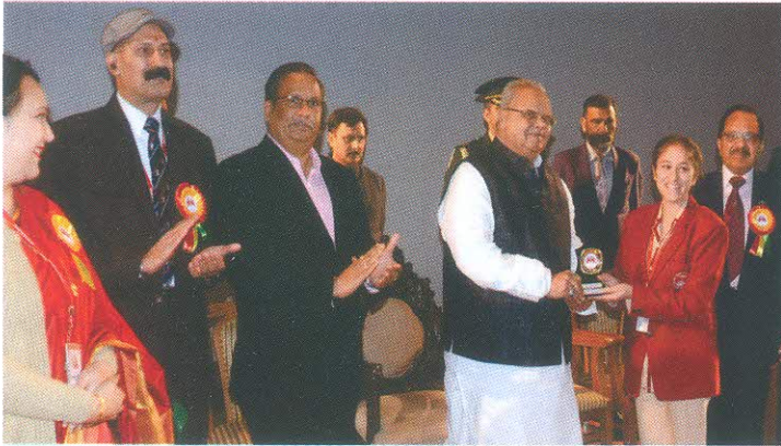
Governor, Sh. Satya Pal Malik giving mementos to outstanding students at the annual day function of SMVDCoN on 30-11-2018

Governor Satya Pal Malik, Chairman of Shri Mata Vaishno Devi Shrine Board, was the Chief Guest.