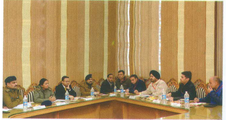
Security arrangements for pilgrimage to the Holy Shrine being reviewed at a joint meeting of officers of Shrine Board and District Administration, Reasi on 13-12-2018

The overall security scenario of the Shrine was discussed in the meeting especially peak rush that the yatra witnesses on 31 st December every year. Besides, various long and short term measures that are required to be taken for strengthening the security grid of the yatra routes, vital installations etc., came up for discussion in the meeting. It was decided that all requisite arrangements including additional CCTV Cameras wherever required and more number of luggage as well as material x-ray scanners will be installed to enhance the vigil and ensure quick and coordinated response of security agencies dealing with the security of the Shrine. The CEO also stressed upon undertaking of extensive patrolling all along the track, particularly on Tarakote Marg.