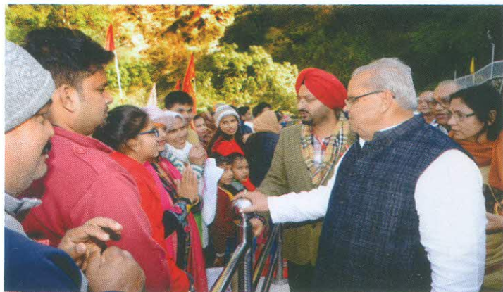
Governor, Sh. Satya Pal Malik interacting with pilgrims at Holy Cave Shrine on 30-11-2018

safaikaramcharis and their supervisors for providing a clean ambience in Shrine area and winning the cleanest religious place award at the national level recently.