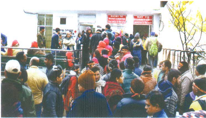
Rush of pilgrims at the Holy Shrine on the eve of New Year