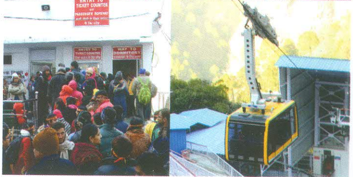
Governor, Sh. Satya Pal Malik inaugurating Passenger Ropeway on 24-12-2018