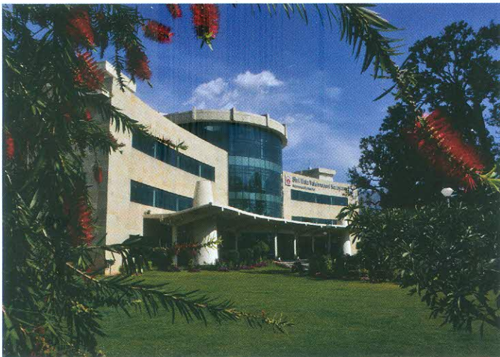
A view of Shri Mata Vaishno Devi Narayana Superspeciality Hospital, Kakryal.

The Governing Body took note of the launching of Ayushman Bharat Scheme and empanelment of this hospital with CGHS. It was felt that keeping this in view, the footfall of patients is likely to increase at the SSH Kakryal and wherever required, the diagnostic and treatment facilities besides other logistics are required to be augmented in tune with the emerging requirements.