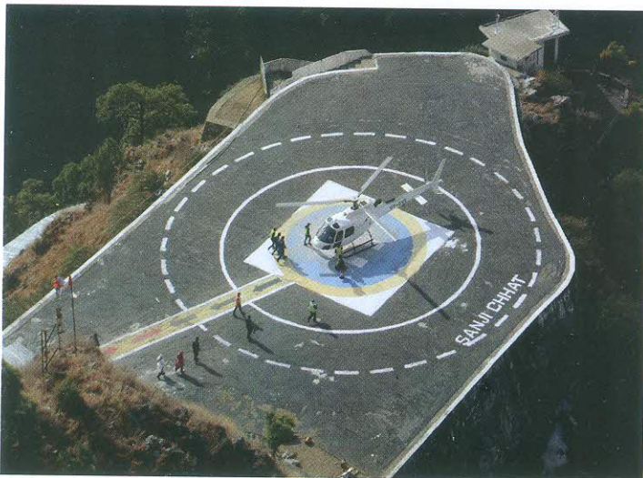
Pilgrims availing heli-service between Katra and Sanjichhat.

The policy for providing 70% refund to the pilgrims on cancellation of pre-booked online helicopter tickets for travel on Katra-Sanjichhat-Katra Sector and rooms as well as dormitory bookings in the accommodations of the Board became operational w.e.f. 1 st August 2018.