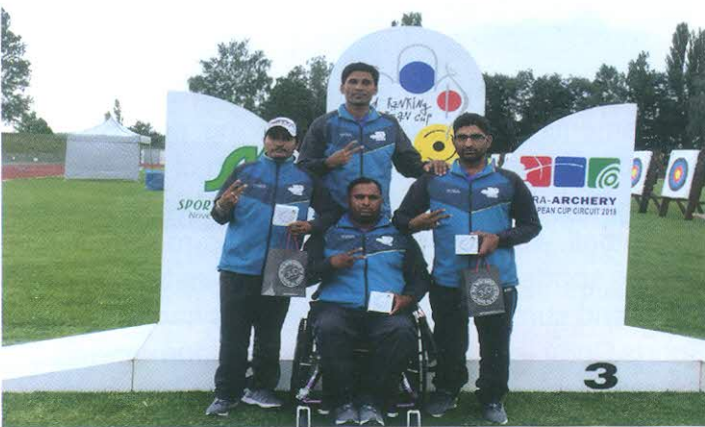
Shrine Board coached Archers win Gold medal in World Ranking Para Archery Championship.