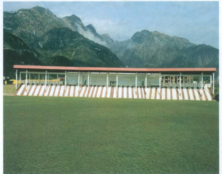
A magnificent view of Shrine Board's Sports Complex, Katra.