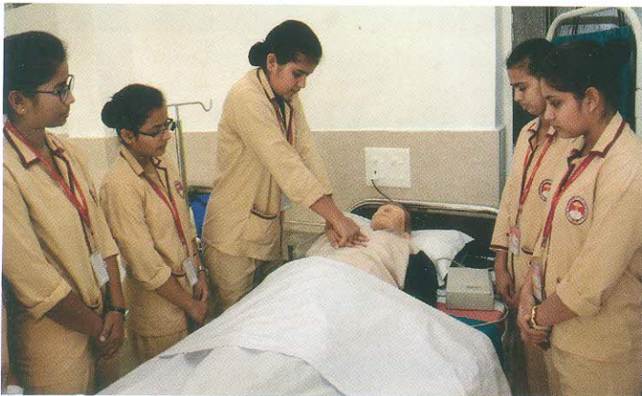
Nursing College students learning CPR techniques.