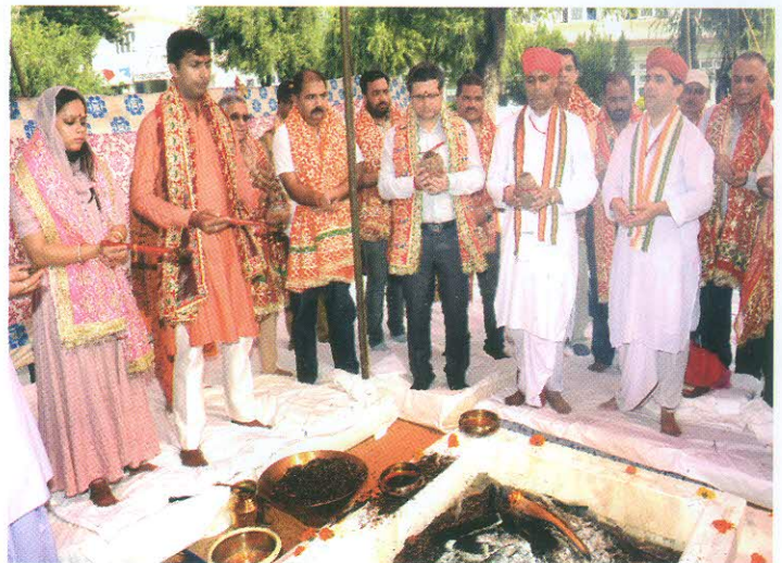
Officers and staff of Shrine Board participating in Havan and Yagya organised on 33rd Foundation Day of SMVDSB.

At the culmination of these functions, Prasad was distributed among the pilgrims by the senior most officers of the respective areas and units of the Shrine Board. Employees of the Shrine Board took pledge on this occasion to perform their duties with sincerity and devotion.