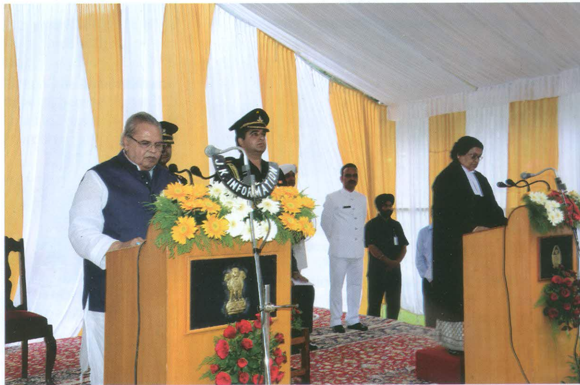
Shri Satya Pal Malik being sworn-in as the Governor of J&K at Raj Bhavan, Srinagar on 23 rd August 2018.

Shri Satya Pal Malik was sworn-in as the Governor of Jammu and Kashmir on 23 rd August 2018.