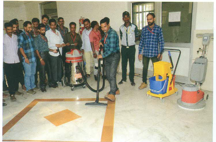
Staff participating in training programme on improved sanitation techniques.

Pertinent to mention that it is incumbent upon every employee of the Board to attend at least one training programme during the year and the outcomes are reflected in the APRs of concerned employee.