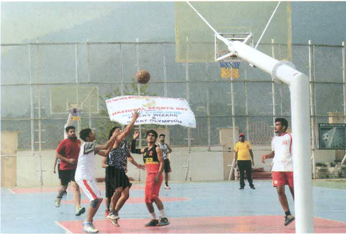
Players participating in basketball tournament organised as part of celebration of 'National Sports Day' at Sports Complex, Katra.