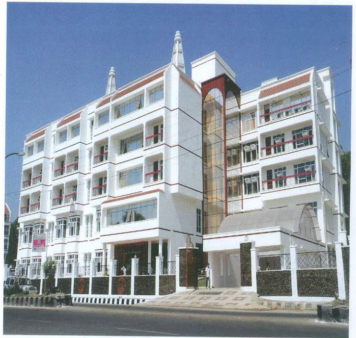
A view of Kalika Dham to provide transit accommodation for pilgrims near Railway Station, Jammu.

This facility of refund will only be available for the pilgrims who cancel their bookings online on the website of Shrine Board at least four days in advance of the scheduled date of travel or stay.