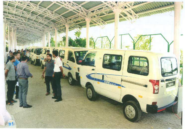
A fleet of new Battery Cars deployed between Adhkuwari and Bhawan on Himkoti Marg to facilitate pilgrims.

Bhawan on Himkoti Marg has been made available by the Board.